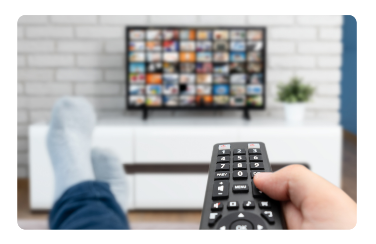
Step 3: Set Up Your Streaming Gear

Finally, set up your streaming devices. If you have a smart TV, it likely has built-in apps. If not, you can use devices like Roku, Amazon Fire Stick, or Google Chromecast to start streaming on your desired platforms!