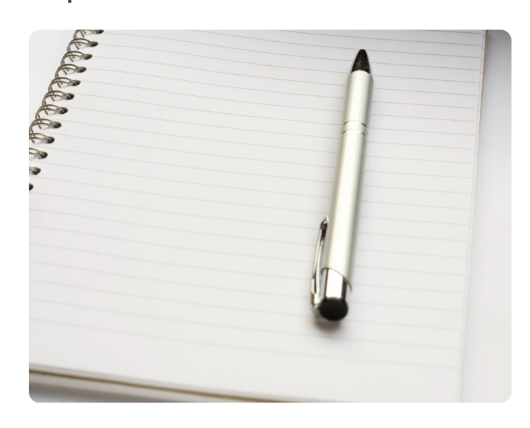
Step 1: List Out the Channels and Shows You Like To Watch

Make a list of the channels and shows you like to watch on cable, like local news stations, live sports programming, or shows or movie channels. Chances are, you're paying for more channels than you currently use, and that could be costing you an extra $1000 a year!